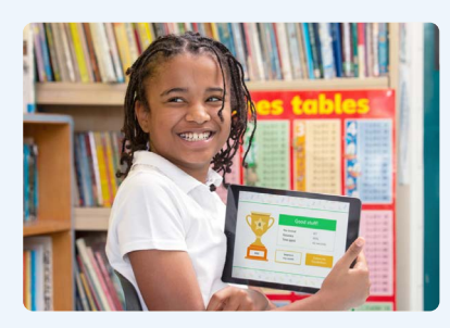
Sparks a love of maths

Doodle empowers all children to believe in themselves, encouraging even the least confident and disengaged learners to keep up their hard work